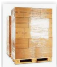
Figure 2: Pallet Schematic Sketch